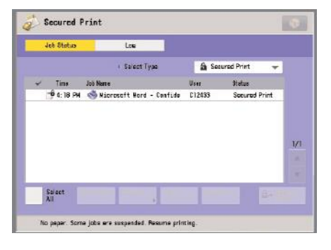
Secured Print Screen from the Printer Driver