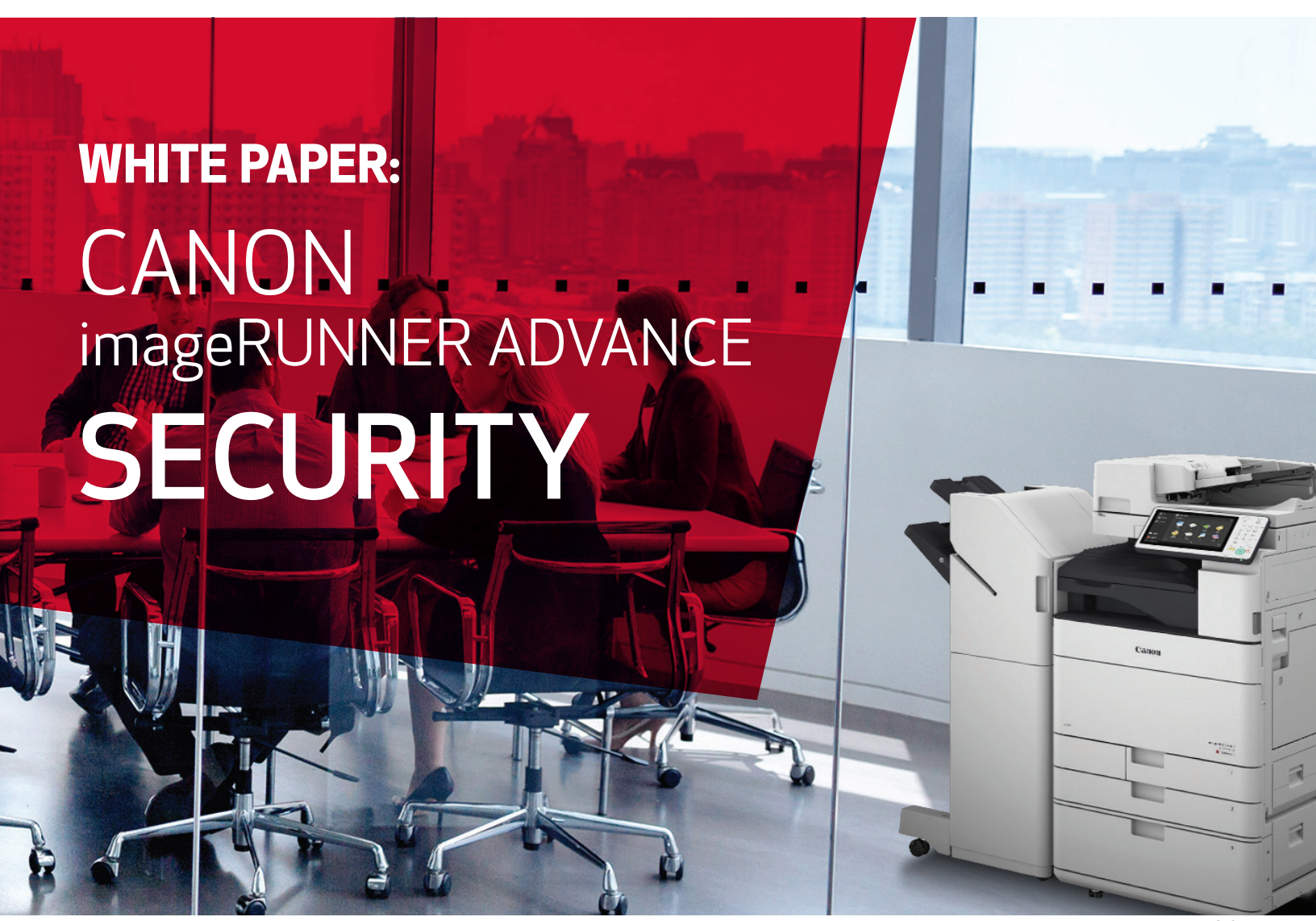
Version 3.9 July 2019